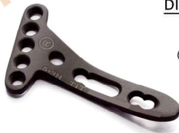
DISTAL RADIUS T-PLATE LOCKING, 2.7MM