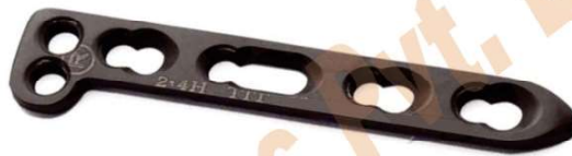
DISTAL RADIUS ANGLED PLATE LOCKING, 2.7MM