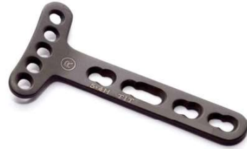
DISTAL RADIUS EXTRA ARTICULAR VOLAR LOCKING PLATE, 2.7 MM